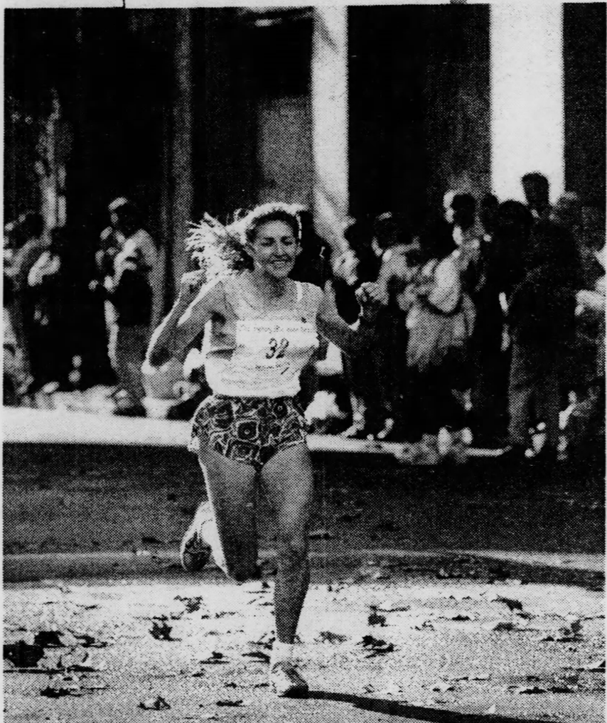
Big finish ... joy on the face of this runner who finished the race on Sunday.